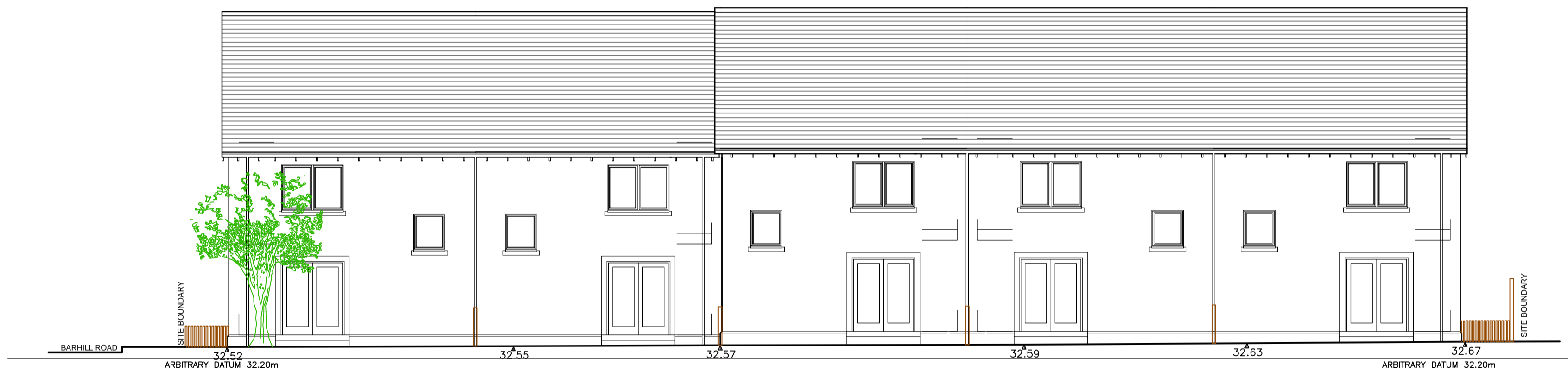
ELEVATION D (REAR ELEVATION, PARALLEL TO NETHERHA ROAD)