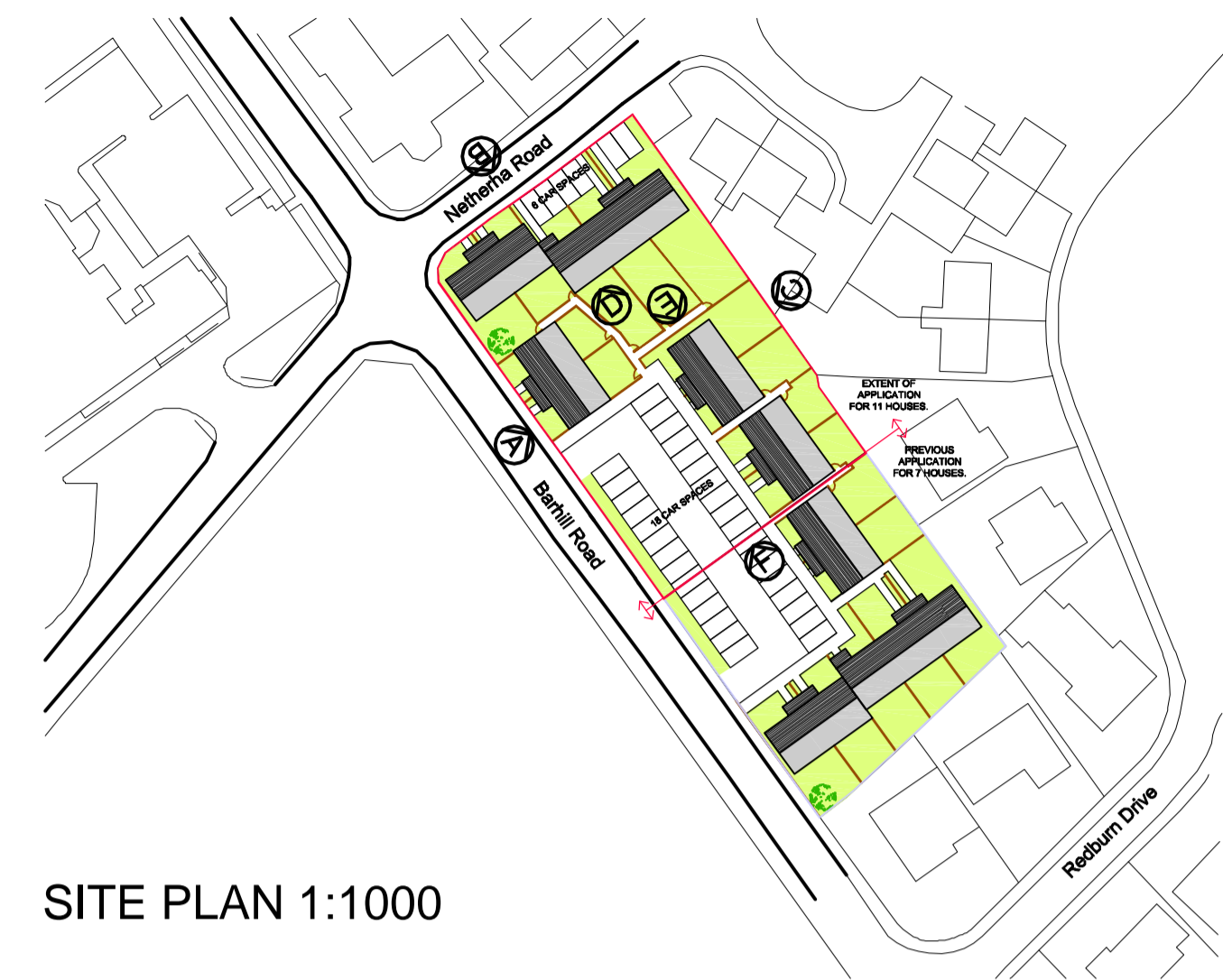
SITE PLAN 1:1000